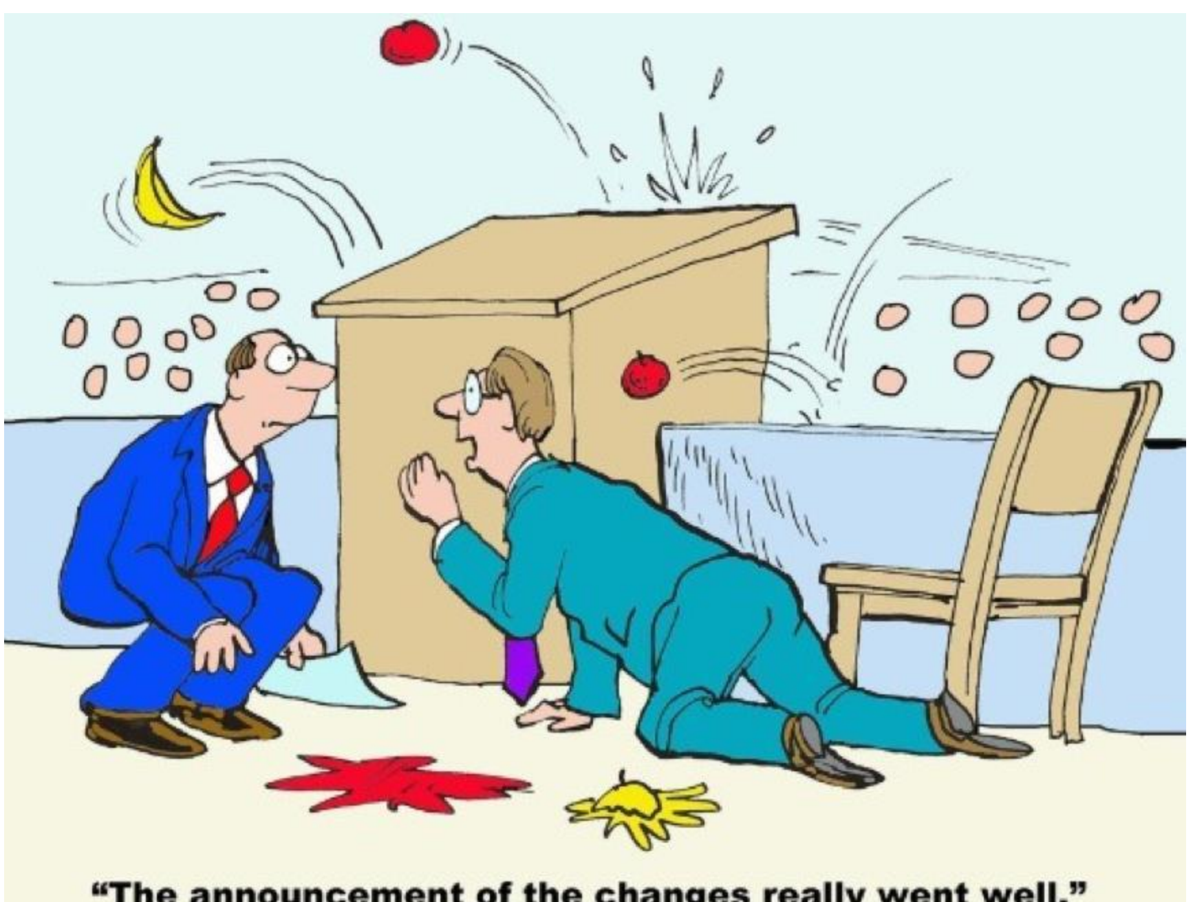
"The announcement of the changes really went well."